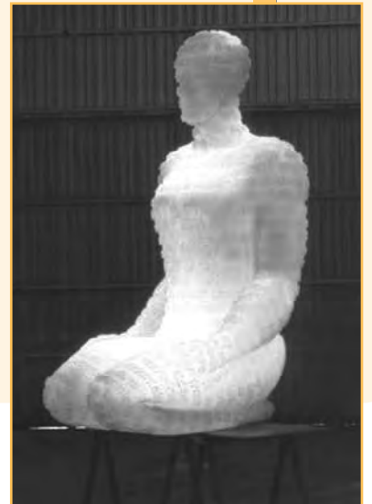
Jaume Plensa's Tattoo, 2003

Tattoo , a sculpture of a man in a meditative pose, is massive, more than 7 feet tall. Unlike stone or metal sculptures, this one is translucent resin that glows with changing colors projected from inside his body. His skin is corrugated with words. It's a manipulation of the cliches we have about people -- seeing through them, seeing into them, looking skin deep, wearing one's heart on the sleeve, or in this case, on one's nose, cheek and thigh. It's both lyrical and grounded.