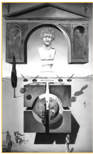
The original Nose of Nero, 1947. Collectors bought signed prints on shopping shows that were forgeries

AN JUAN CAPISTRANO, CA - Two unsuspecting art collectors -- and possibly hundreds of others --recently discovered that the signed Salvador Dalí prints they had just purchased were forgeries. Other than having an appreciation for Dalí's work, the only thing the two men had in common was that they had purchased the art from television shopping shows on DirecTV. Upon investigation, a Dalí expert determined that these shows have been selling dozens of fakes.